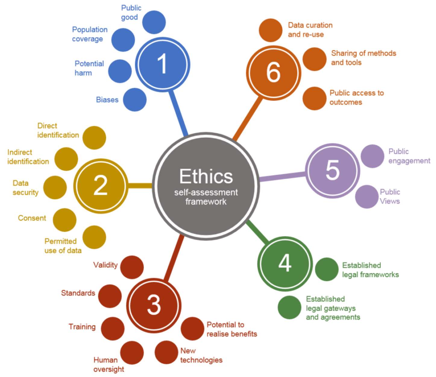
Figure 1 A dendrimer diagram showing the subprinciples which make up the six primary principles – 1) public good, 2) confidentiality, 3) methods and quality, 4) legal compliance, 5) public views and engagement, 6) transparency. Copyright UK Statistics Authority, <u>URL</u>.